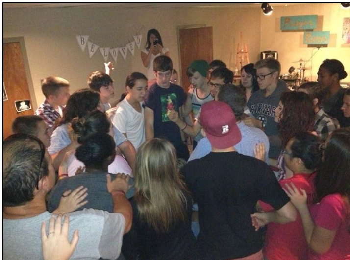
Praying before going out of our Home Oklahoma Base

The Burn Wagon teams went through 3 days of intensive prayer, fellowship, and training. I am awed by the amazing love of God and what He has instilled in me. At the start of the hands-on training, I was really nervous and uncomfortable. After each training session, we were paired up to practice what has been taught. This was something I was not looking forward to. In all my years of life, it has never crossed my mind that someone like me could ever be used as a vessel by God. Time and time again, satan tried to put me down with self-doubt and negative thinking. However, God continues to shepherd me through. Praise the Lord!