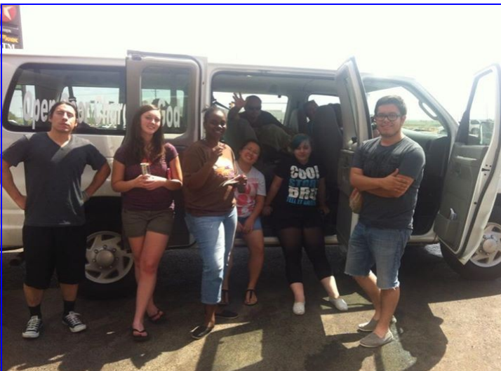
West Coast Burn Wagon Team

About a month before graduation, I was asked to join the West Coast Burn