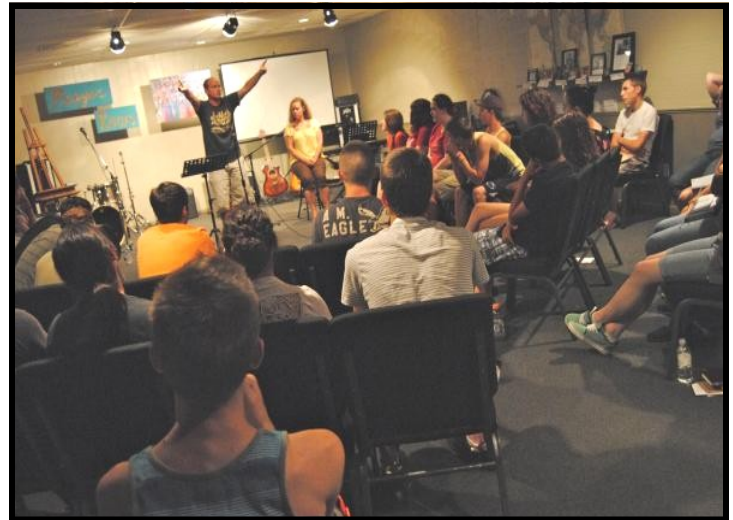
Training and Praying at Oklahoma Base West Coast, North East, North West Teams June 7-9, 2013