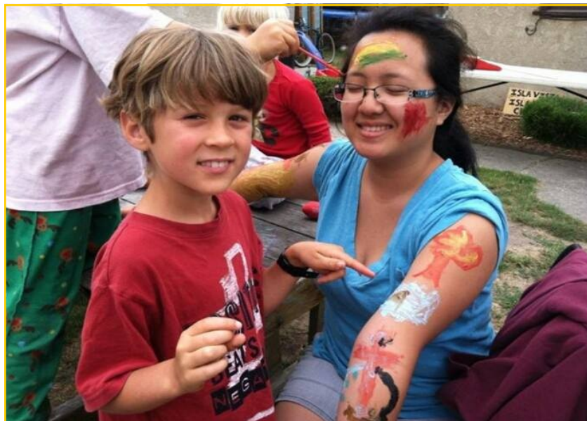
Face painting in Juarez, Mexico